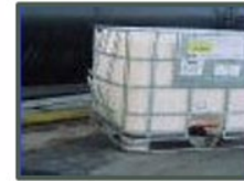
Damaged Cage and/or Pallet