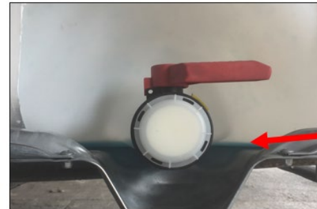
0.8 gallon, below the valve