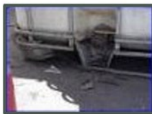
Damaged Corner Piece